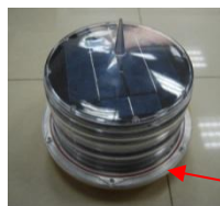
Open the housing